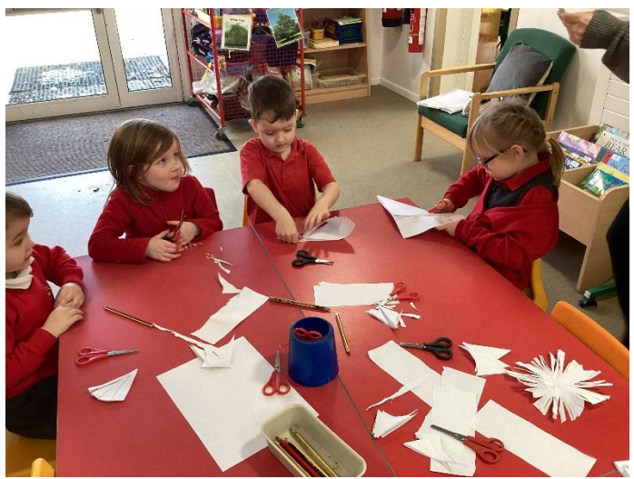
Making patterns in maths