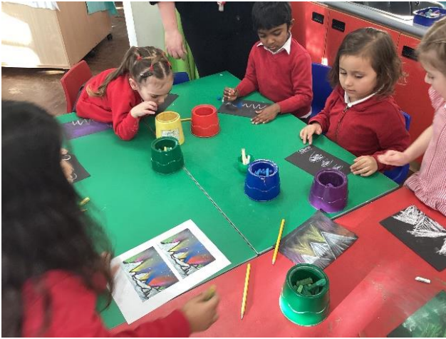
Drawing the northern lights