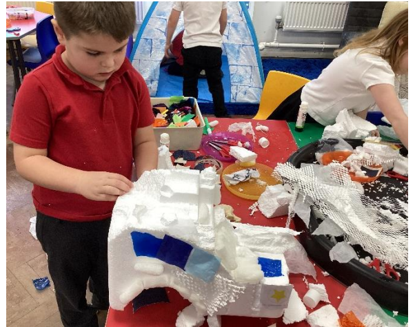
Making our 3D penguins