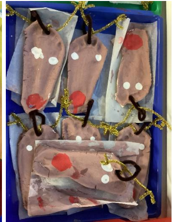
Our festive fun day