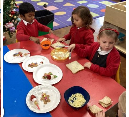
Decorating our gingerbread men