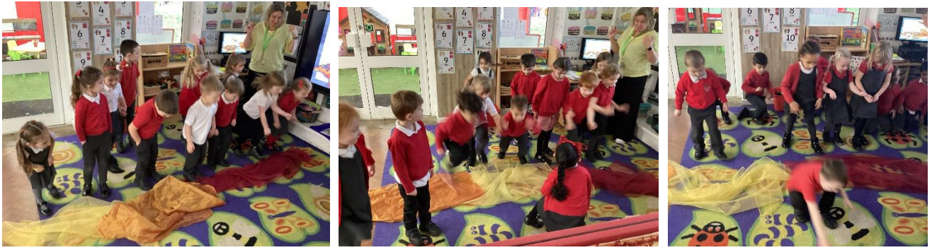
Musical statues and musical bumps