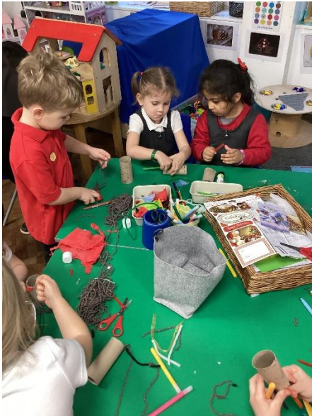
Making our string puppets