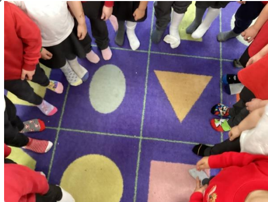
(Reception's odd socks)

Anti-Bullying Week 2023 took place from Monday 13 th to Friday 17 th November starting with Odd Socks Day on the Monday – a great way to celebrate what makes us all unique in Anti-Bullying Week: