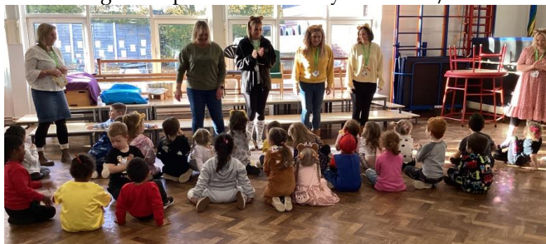
(Reception staff production of Goldilocks and the Three Pudding Bears for Children in Need)

Thank you for all of your very generous donations for Children in Need. We raised an amazing £236.63 – very well done. Thank you also for your support using our Just Giving page – we will continue to use this method in future when fundraising for a specific cause to try to reduce / eliminate having cash in school: