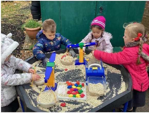
Children weighing and measuring porridge with the bears