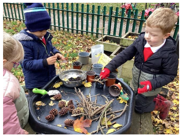
Making bear faces with natural materials / Our winter tree art