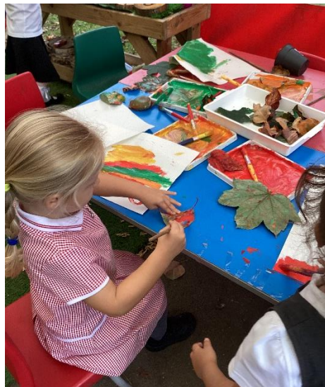
Practicing our fine motor skills