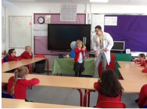
Making a tornado was really tricky!

To finish, KS2 wanted to share that in design and technology this half term, the children have been investigating torches. They have looked at the uses of a torch and how they work. The children then created a simple circuit and investigated different types of switches and the most appropriate casings. The next step was to design their torch and finally they made their finished products. They completed the unit of learning by evaluating the torches against their designs. The children had lots of fun experimenting with casings and switches!