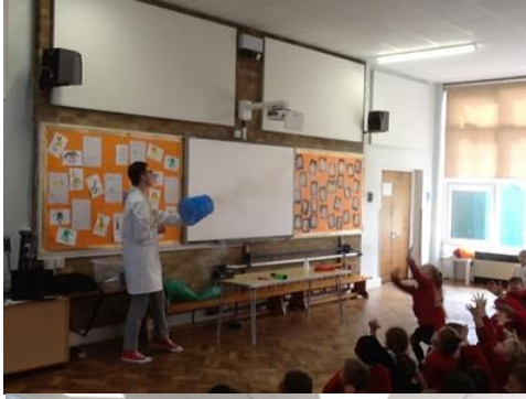
Using smoke to show the air moving.