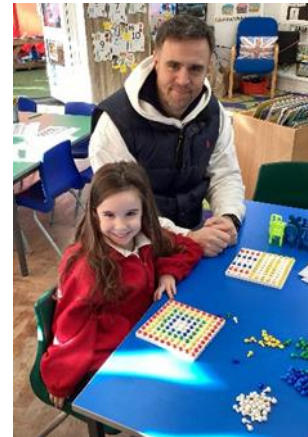
Reception Valentine's Tea